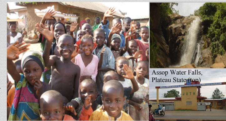
Entrance to Jos University Teaching Hospital (JUTH) Nigeria Medical Mission 2010

Some Jos indigenes residing in the USA have been actively involved in the relief efforts by contributing food supplies and building materials to construct schools closer to the villages in Dogo-Na-Hawa. Currently, these children live in constant fear of being attacked when traveling to schools that are outside of their villages.