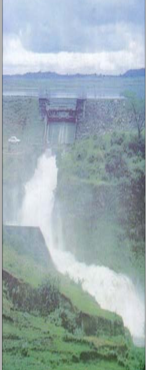
Kurra Falls,, South-East of Jos