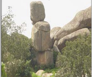
Riyom Rock (located along the Jos-Akwanga road)